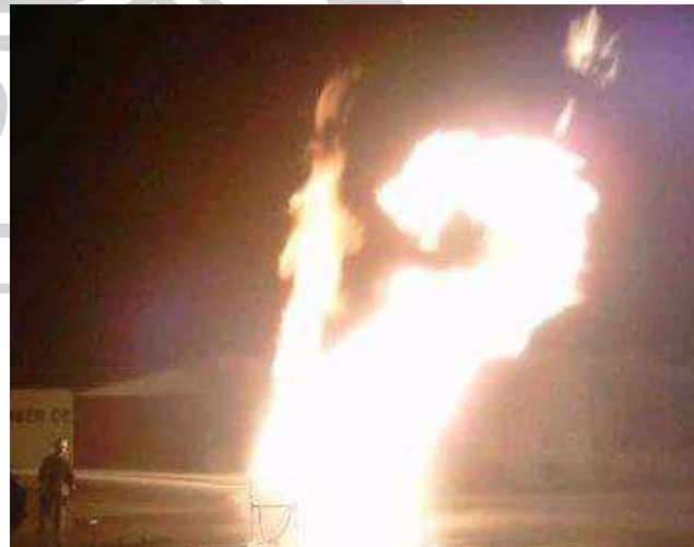
Photo of the "Dragon" looking down on me during a Propane Live Fire class taught in Greenfield IN.